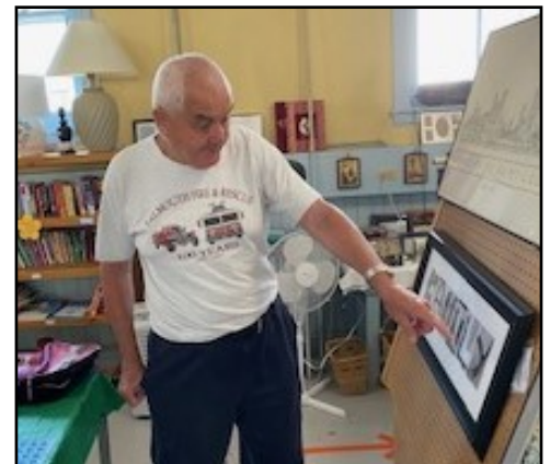
Working in the Thrift Shop

I enjoy working at the Thrift Shop and harassing the customers and making them laugh.