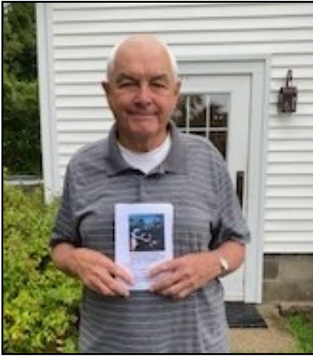
The Official Greeter at WFUMC

I was born in Portland, Maine and grew up in South Portland. My father worked at Bath Iron Works and later at the Portsmouth Naval Shipyard. When I was four, we moved to Kennebunkport, which was a better commute for my father. He built our home—he even dug the cellar, bought TNT and blew the ledge, and built the foundation. He was a master machinist and my mother was a homemaker. I am the youngest; I had two sisters and one brother. One sister is still living and she is in South Portland.